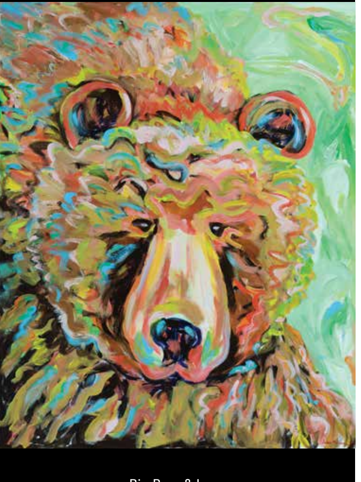
Big Bear & Lace

23 S. Willson | Downtown Bozeman, MT 406.586.8696